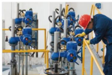
▲ Other Industries