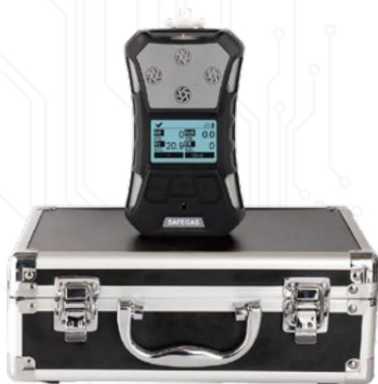
SKY3000 — Portable gas detector

SKY3000 series is a high-performance portable gas detector that can detect multiple gases (Oxygen compounds VOC, combustible gas and toxic gas) at the same time and has man down alarm function. The device has humanized operation functions such as one-key security detection, one-key storage, automatic image flipping, as well as the man down alarm function; With optional Bluetooth transmission function, allowing safety personnel to obtain real-time data and the alarm status. It has obtained international IECEx, ATEX explosion-proof certification and Chinese explosion-proof certification; As it passed the antistatic test, and the protection level reaches IP67; With safer product design and the module design which makes the detection faster, and the compact ergonomic design makes the device easy carrying; The instrument is mainly working in suction mode. When the air pump fails or in special emergency situations, it can automatically switch to the diffusion sampling method, thereby improving the protection to a new Level.