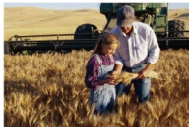
▲ Agricultural & Environmental Protection