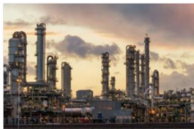
▲ Petrochemical & Chemical Industry