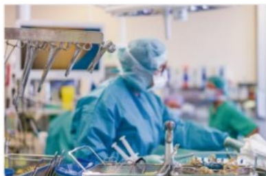
▲ Food & Pharmaceutical Industry